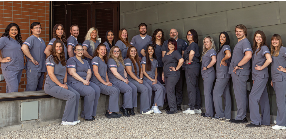
NOT PICTURED – OLIVIA PETERSON